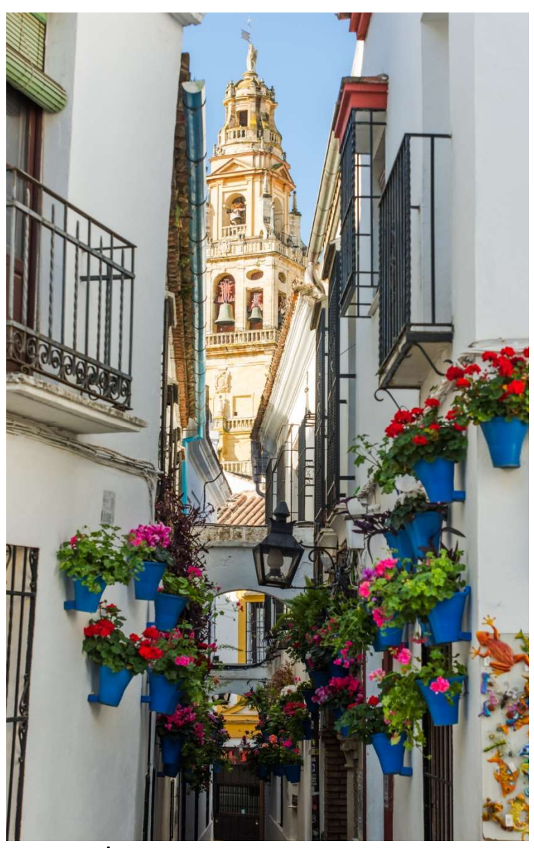
Price: $ 3,550 CAD per person dbl occ Land Package only March 31, 2025 to April 9, 2025