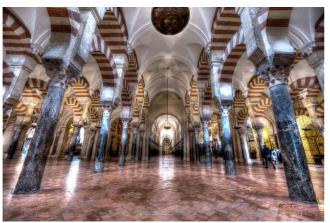
Cordoba Forest of Columns