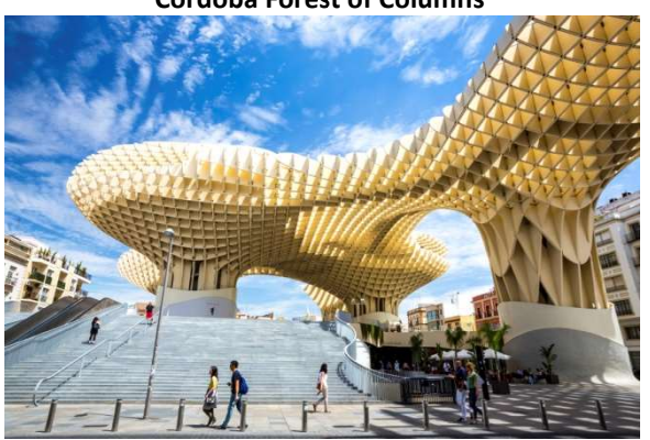
Seville Metropol Parasol